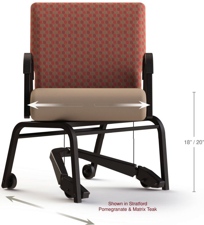
Shown in Stratford Pomegranate & Matrix Teak