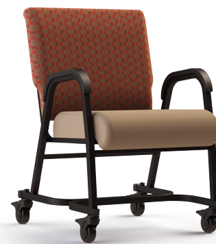
It Rolls, It Locks.

When a rollator or walker is required for mobility, it becomes cumbersome to get seated at a table. The Titan Swivel feature allows the person to transition easily into a chair, then to be moved forward by a caregiver.