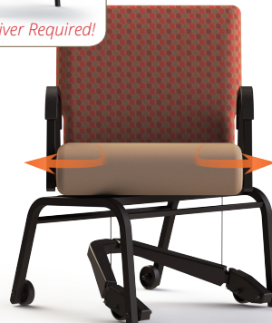
It Moves, It Swivels.

An early sign associated with mobility loss is required cane use. While daily caregiver assistance is unnecessary, residents may appreciate some gentle assistance to sit at a table. The Titan with mobility assist feature is useful here.