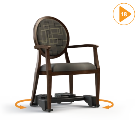
Contessa 200 w/ CCB It Turns...It Rolls...and Brakes for Safety