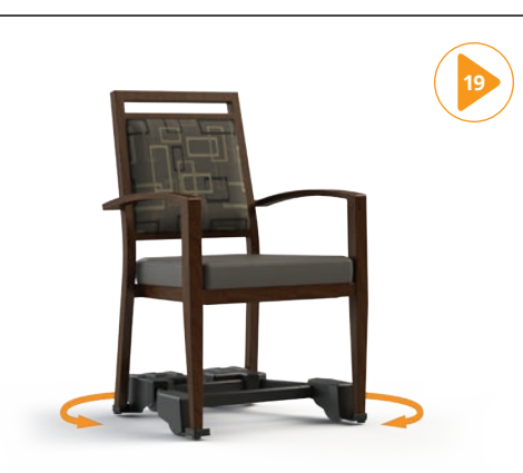
Contessa 300 w/ CCB It Turns...It Rolls...and Brakes for Safety