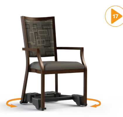
Contessa 100 w/ CCB It Turns...It Rolls...and Brakes for Safety