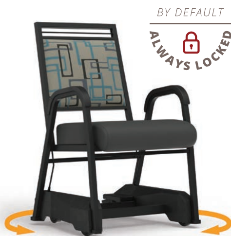
T2 Caddie shown with hand brake release.