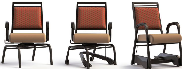
It Swivels. It Locks. T2-841SWL-24"