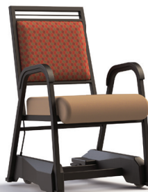
It Moves. It Locks. T2-841-22"-CC