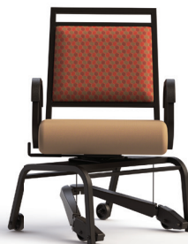
It Swivels. It Rolls. It Locks. T2-841SWL-22"-REZ