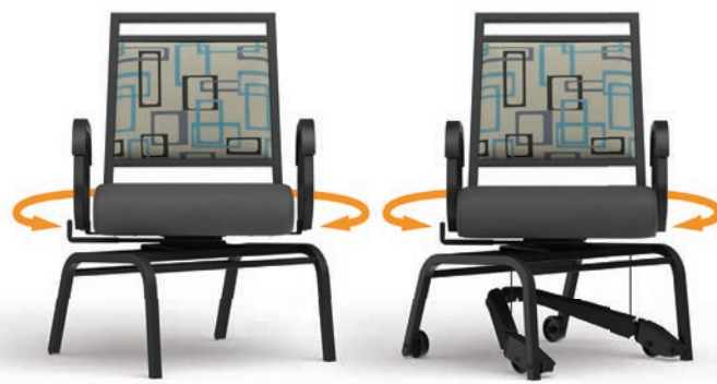
T2-841SWL-22" / 24"