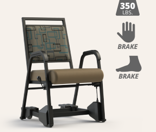
T2-841-22"-CC2 Independent Living