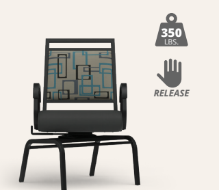
T2-841SWL-22" (18" SH) Independent Living