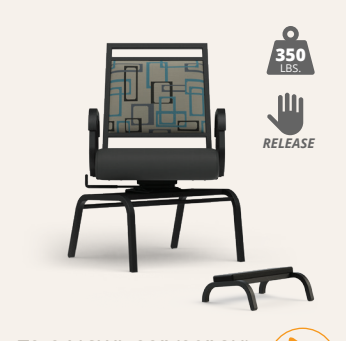
T2-841SWL-22" (20" SH) Independent Living