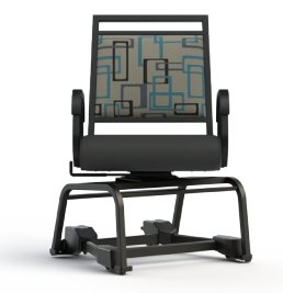
T2-841SWL-22"-CC5 (18" SH)