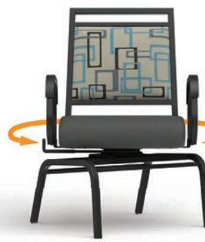
T2-841SWL-22" / 24"