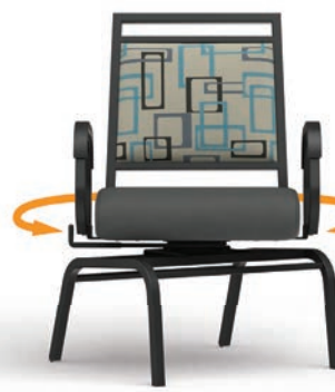
T2-841SWL-22" / 24"