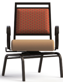
It Swivels. It Locks. T2-841SWL-24"