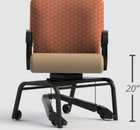
(L) 841SWL-22"-REZ (SH-20)