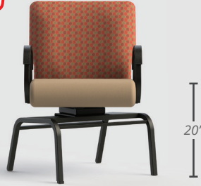
(K) 841SWL-22" (SH-20)