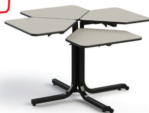
(U) BFL-4-(4/1) Wheelchair Accessible Table