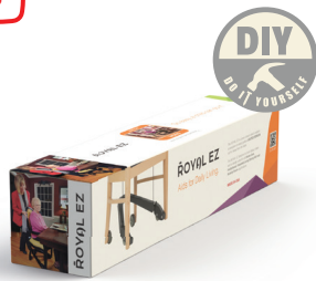
(A) Royal EZ Kit ONLY