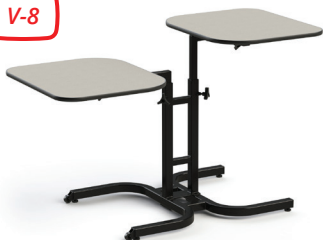
(T) BFL-2-(1/1) Wheelchair Accessible Table