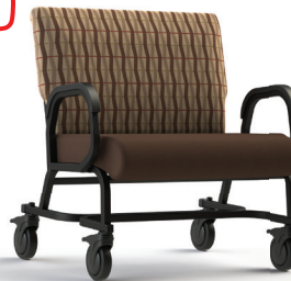
(P) 941CAS-24" (Q) 941CAS-30"