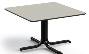
(W) BFL-4-(42x42) Wheelchair Accessible Table