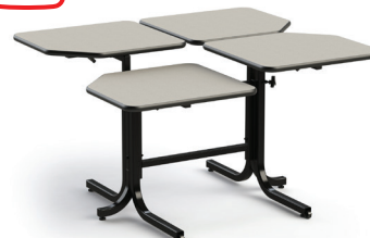
(V) BFL-4-(2/2) Wheelchair Accessible Table