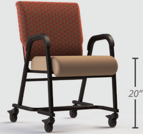
(H) 841CAS-22" (SH-20)