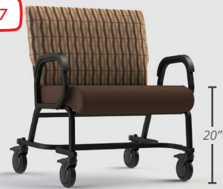
(R) 941CAS-24" (SH-20) (S) 941CAS-30" (SH-20)