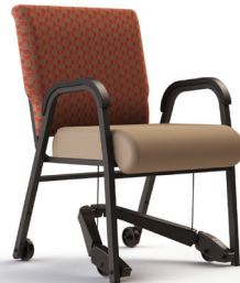
(E) 841-20"-REZ (F) 841-22"-REZ