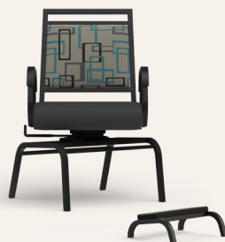
T2-841SWL-22" (20" SH) Independent Living