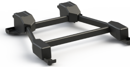
Chair Caddie A It Rolls...Locks for Safety