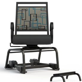
T2-841SWL-22"-CC5 (20" SH)