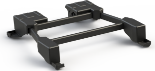
Chair Caddie B It Rolls...Turns...Locks for Safety