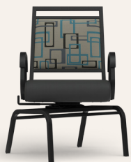
T2-841SWL-22" (18" SH) Independent Living