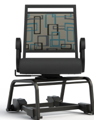
T2-841SWL-22"-CC5 (18" SH)