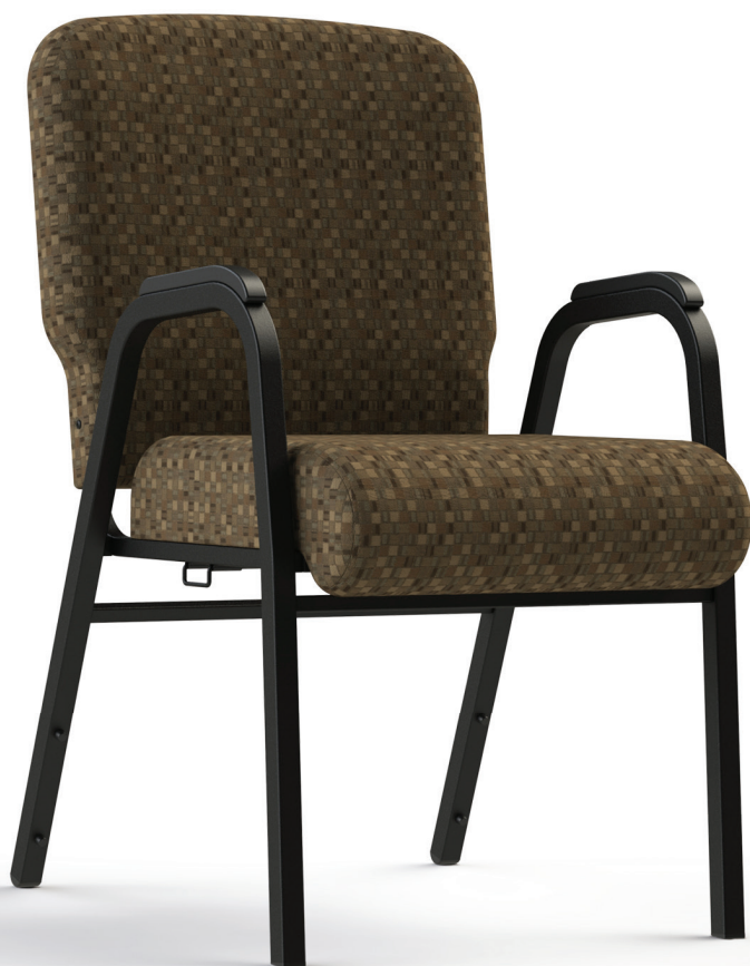
Shown in Empire - Chocolate / Textured Black Frame