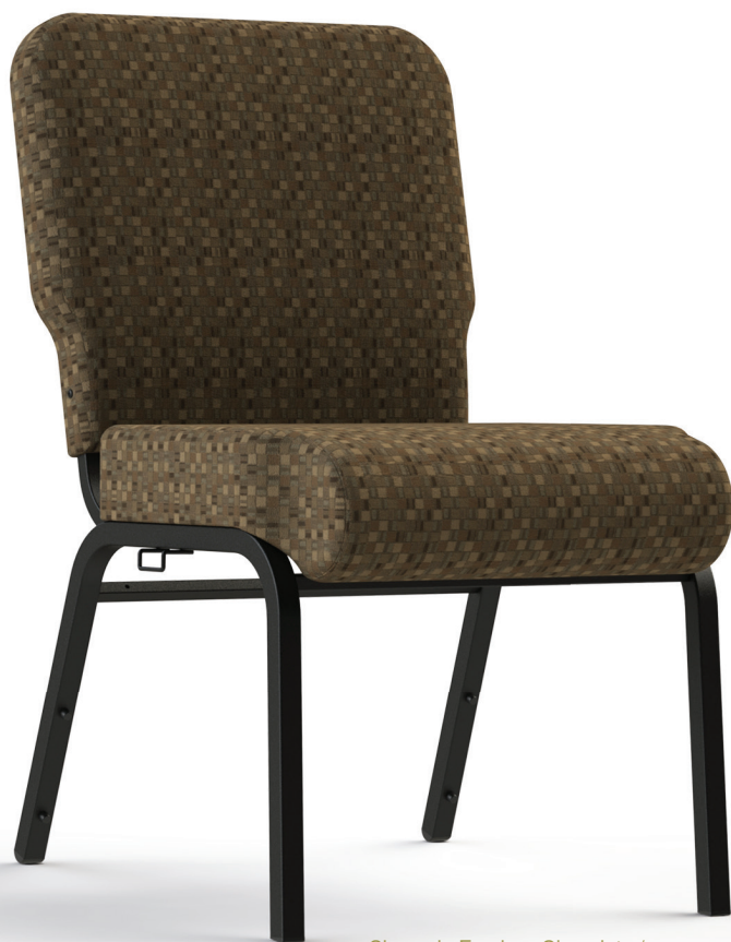
Shown in Empire - Chocolate / Textured Black Frame