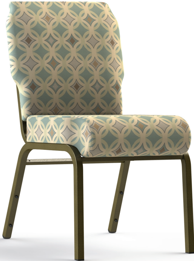
Shown in Salinas - Moonstone / Antique Brown Frame