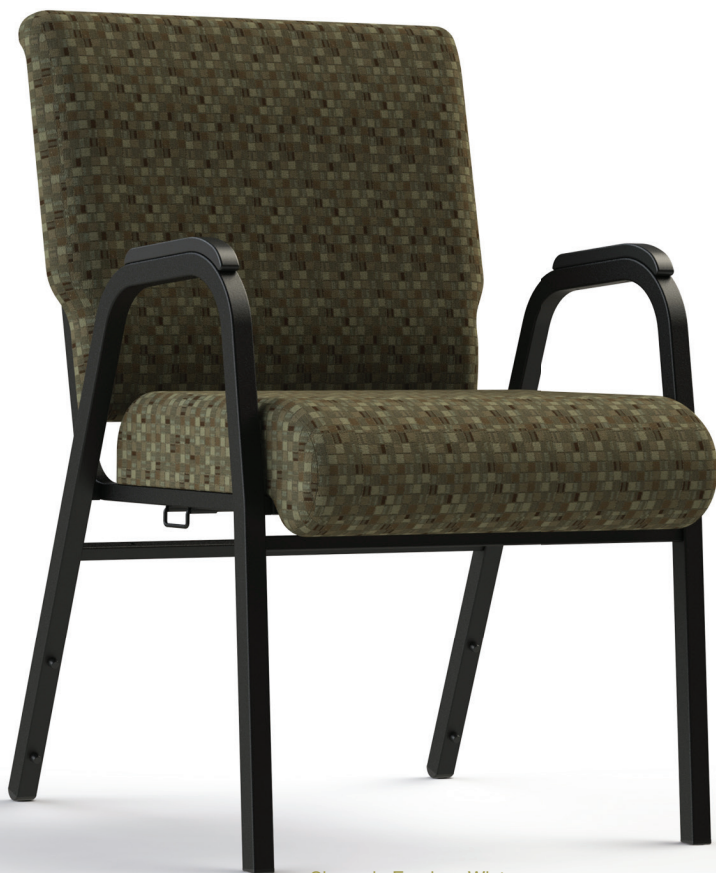
Shown in Empire - Wintermoss / Textured Black Frame