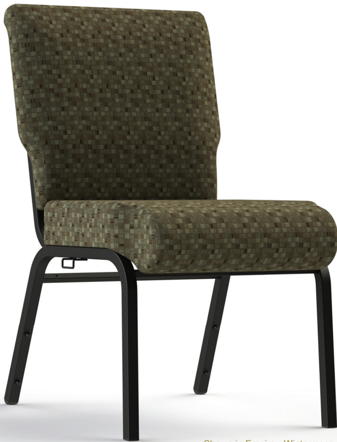
Shown in Empire - Wintermoss / Textured Black Frame