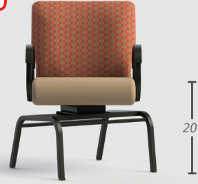
(K) 841SWL-22" (SH-20)