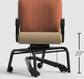
(L) 841SWL-22"-REZ (SH-20)