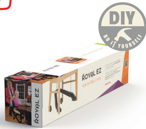
(A) Royal EZ Kit ONLY