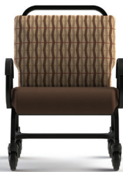
941CAS-24" w/ Casters