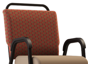
Titan Handle Bar

Titan Handle Bar available on all castered chairs.