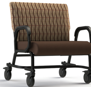
(K) 941-24"-BAR / (L) 941-30"-BAR