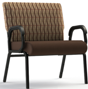
(I) 941-24" / (J) 941-30"