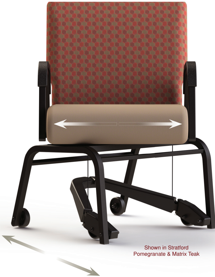
Shown in Stratford Pomegranate & Matrix Teak