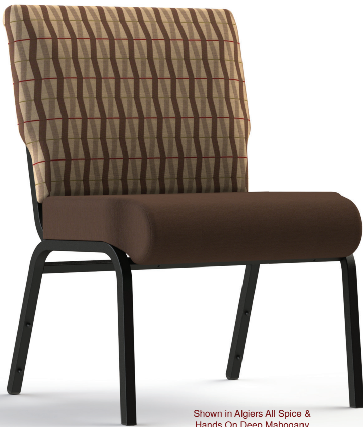
Shown in Algiers All Spice & Hands On Deep Mahogany